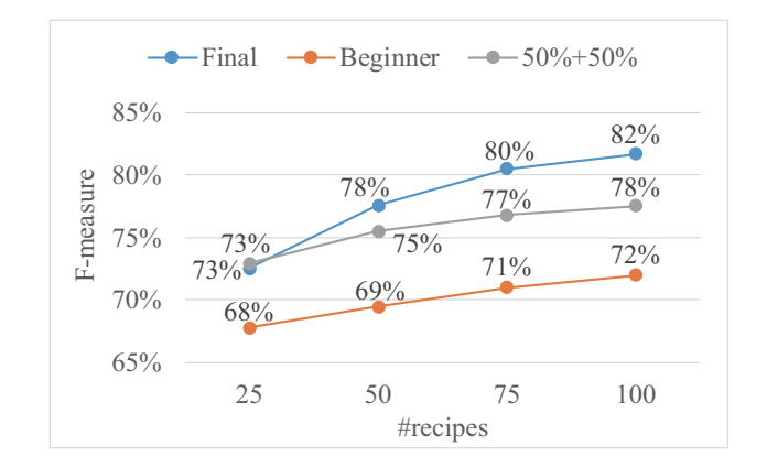
Fig. 4. Classification accuracies with different size of first and final annotation results.

brought almost the same accuracy with 100 of "1st Rslt." This result suggests that final annotation results are significantly effective to obtain higher classification accuracy.